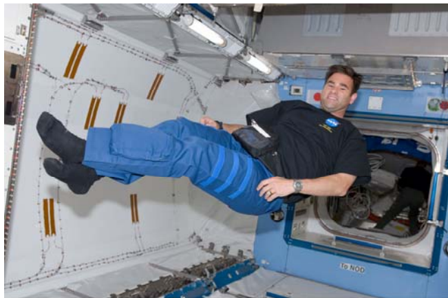
Astronaut Greg Chamitoff, Expedition 17 flight engineer, floats in the newly installed Kibo Japanese Pressurized Module of the International Space Station while Space Shuttle Discovery (STS-124) is docked with the station

Stay tuned to our website www.mithouston.org for the latest NASA mission status!